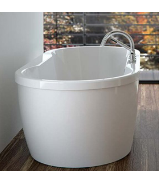
ENSUITE Freestanding Tub *If applicable