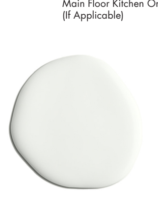
WALL PAINT COLOUR Chantilly Lace Eggshell Finish

KITCHEN ISLAND Brushed Nickel Pendant Main Floor Kitchen Only