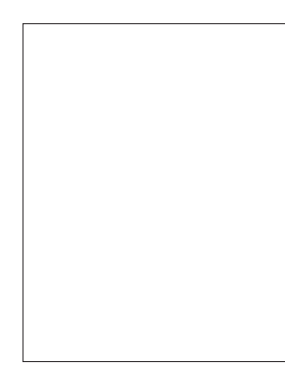
CABINETS** Cotton Kitchen Upper(s), Island(s), Primary Ensuite & Powder Room*