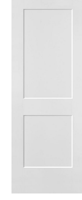
INTERIOR DOOR Logan