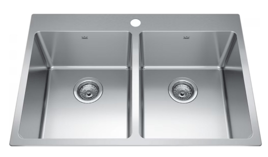
KITCHEN Stainless Steel Sink

** = Please note: Upper and lower cabinet color variations will occur in Multi-Gen Towns with panel-ready appliances. Panel-ready appliances are available as an upgrade option at the time of signing.