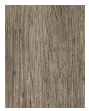
CABINETS** Warm Wood Look Kitchen Lower(s) & Main Bath(s)

** = Please note: Upper and lower cabinet color variations will occur in Multi-Gen Towns with panel-ready appliances. Panel-ready appliances are available as an upgrade option at the time of signing.