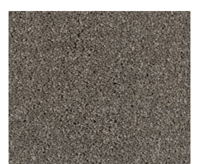
CARPET Morning Light Main to Second Floor Staircase & All Bedrooms