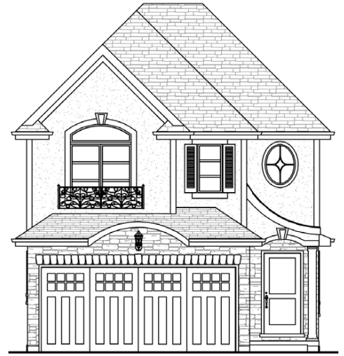
ELEVATION OPTION C