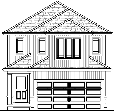
ELEVATION OPTION A