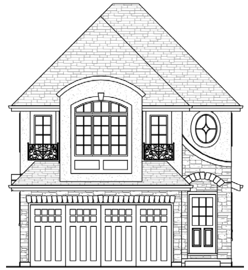
ELEVATION OPTION C