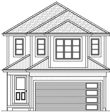
ELEVATION OPTION B