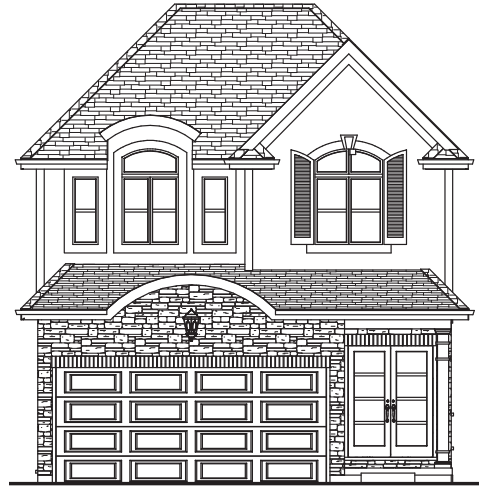
ELEVATION OPTION C