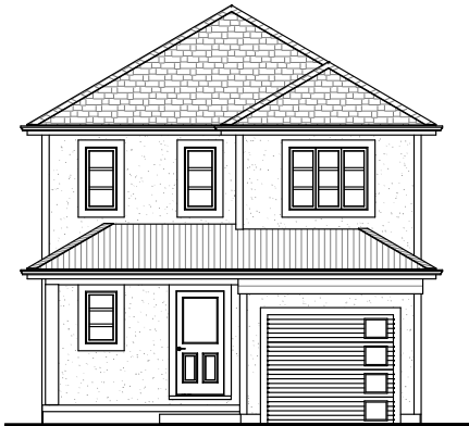
ELEVATION OPTION B