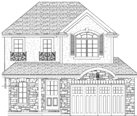
ELEVATION OPTION C