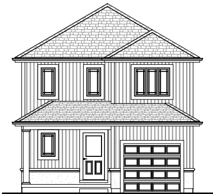
ELEVATION OPTION A