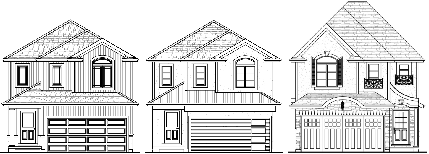
ELEVATION OPTION A