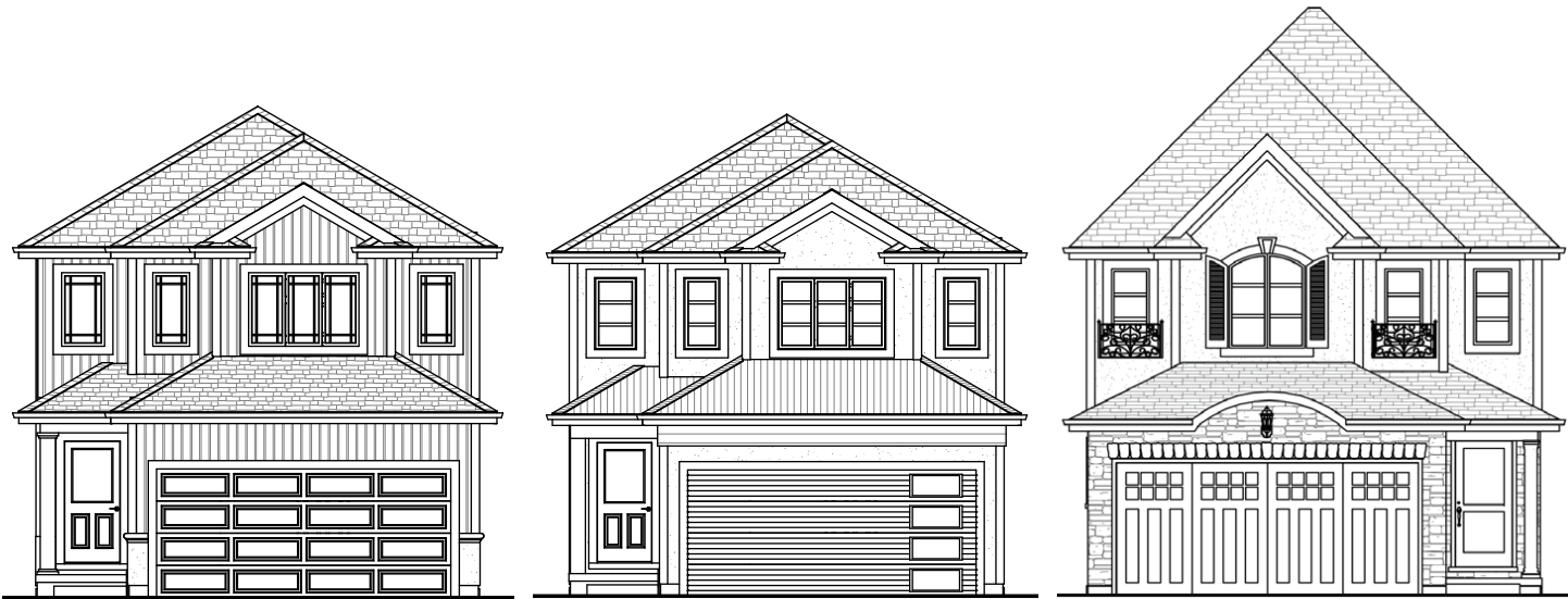
ELEVATION OPTION A