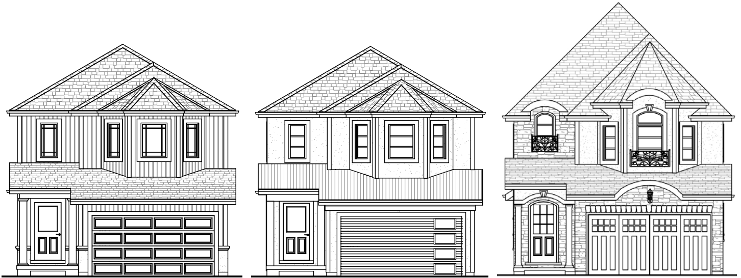
ELEVATION OPTION A