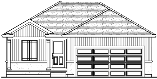
ELEVATION OPTION A