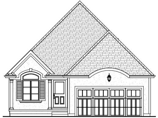
ELEVATION OPTION C