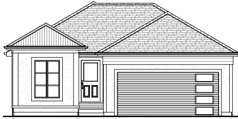
ELEVATION OPTION B