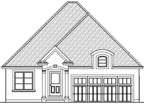
ELEVATION OPTION C