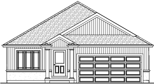
ELEVATION OPTION A