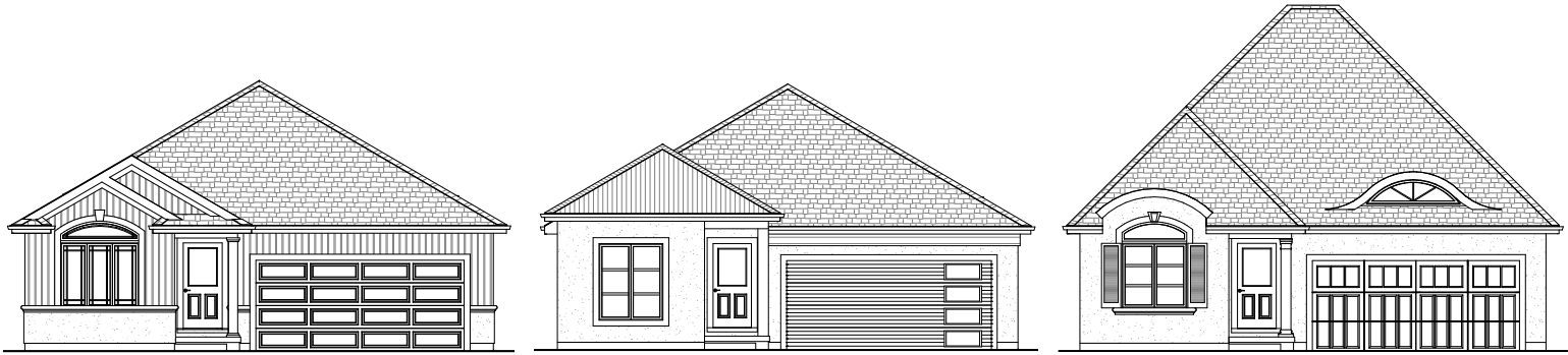
ELEVATION OPTION A