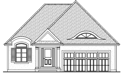
ELEVATION OPTION C