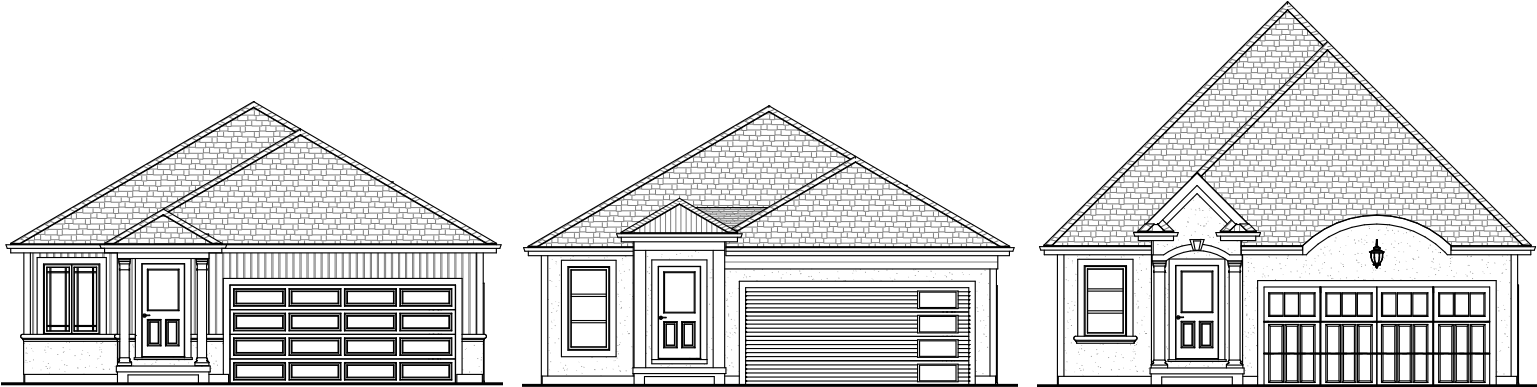
ELEVATION OPTION A