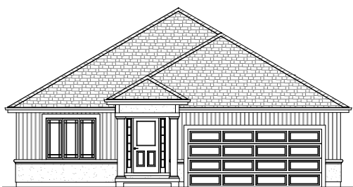
ELEVATION OPTION A