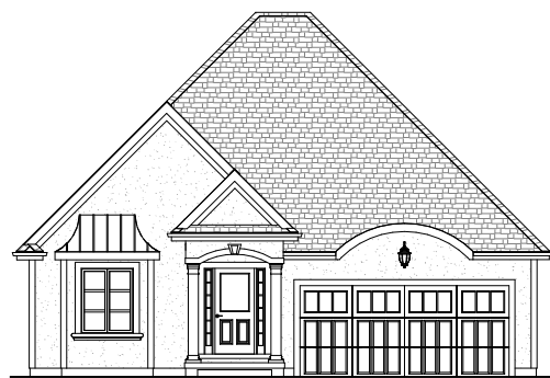
ELEVATION OPTION C