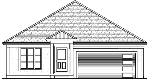
ELEVATION OPTION B