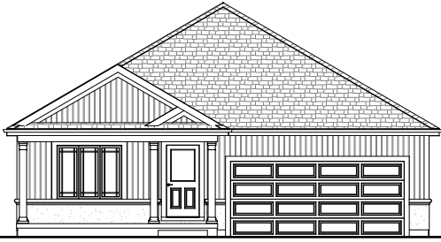
ELEVATION OPTION A