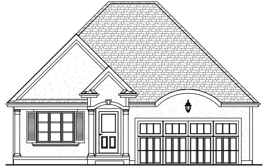
ELEVATION OPTION C